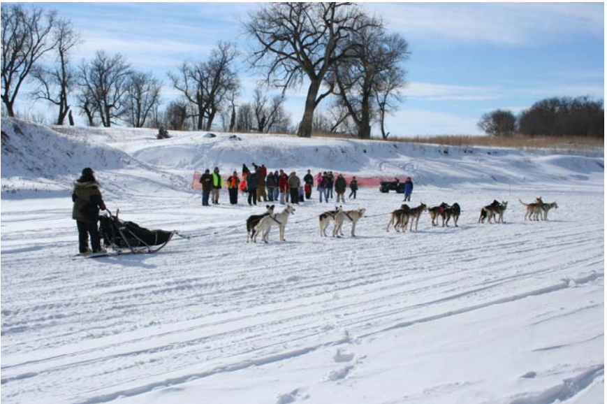
Nancy KC0YXB arriving at the Frog Point checkpoint