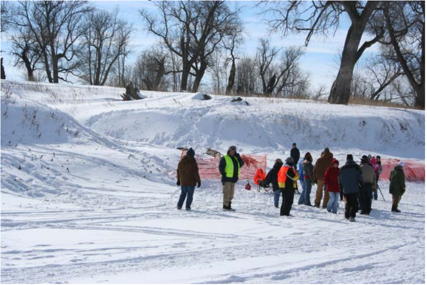
John WA0LPV (green vest) reporting arrivals at Frog Point checkpoint