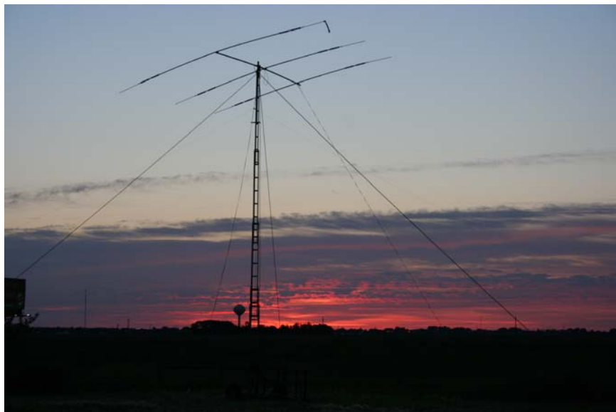
Sunrise on the SSB Beam/Tower - Sunday, June 29, 2008