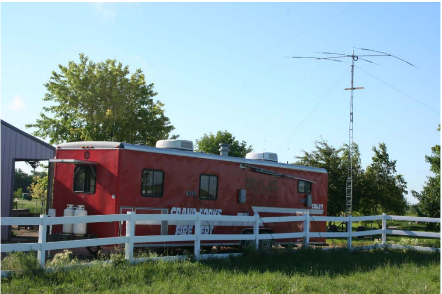
Trailer used for Phone and Digital Stations FD 2010