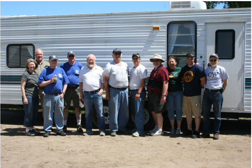
FD 2010 crew (less a few others)